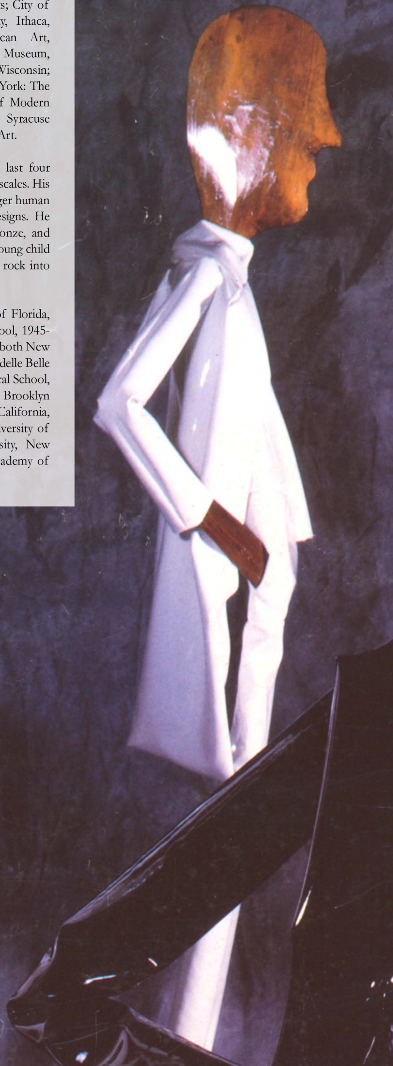
MY VACATION, 1966 bronze, 24" high