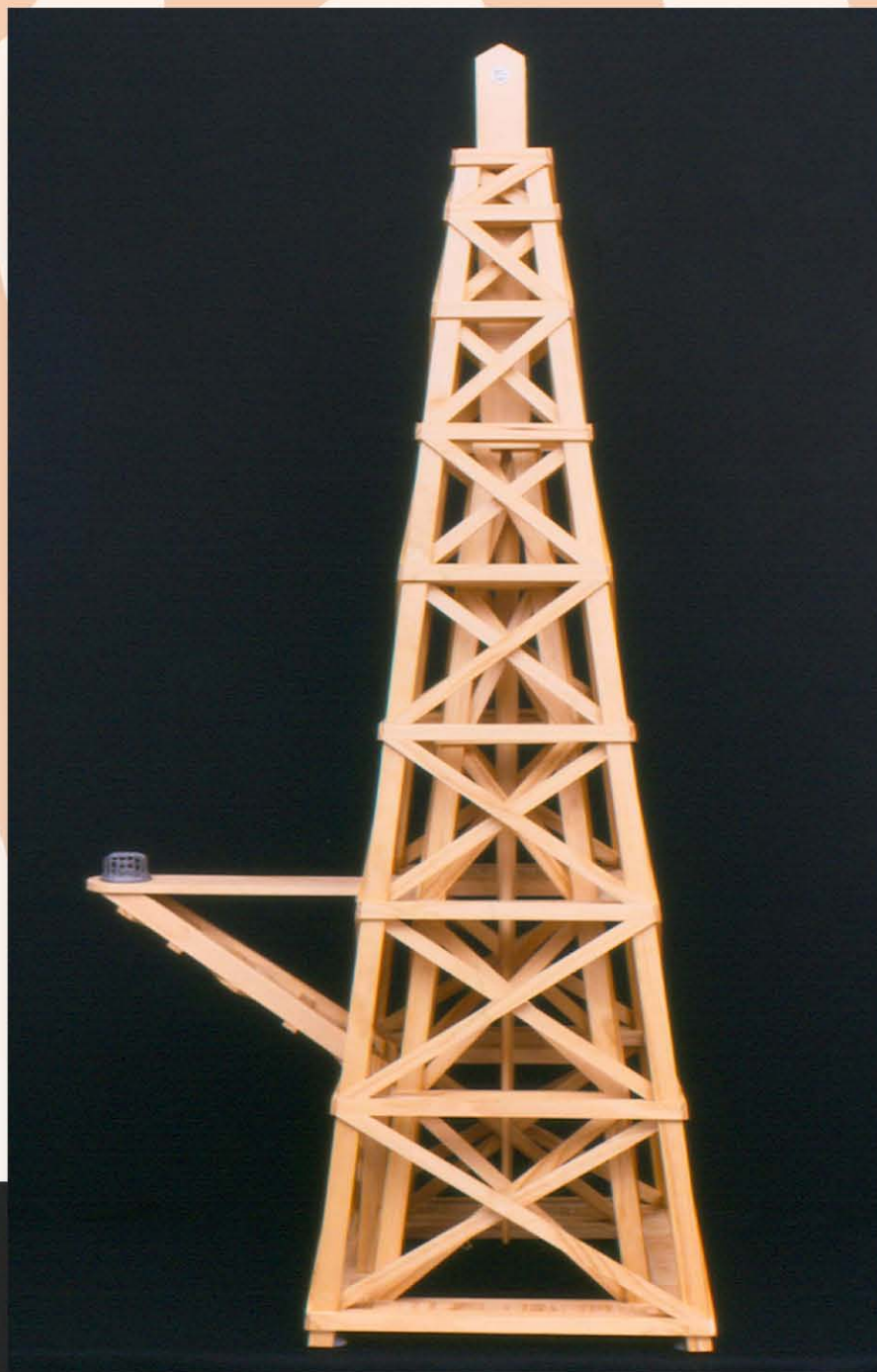
TANK 12/4, cypress, stainless steel and cast iron, 11' 9" x 6' x 6'