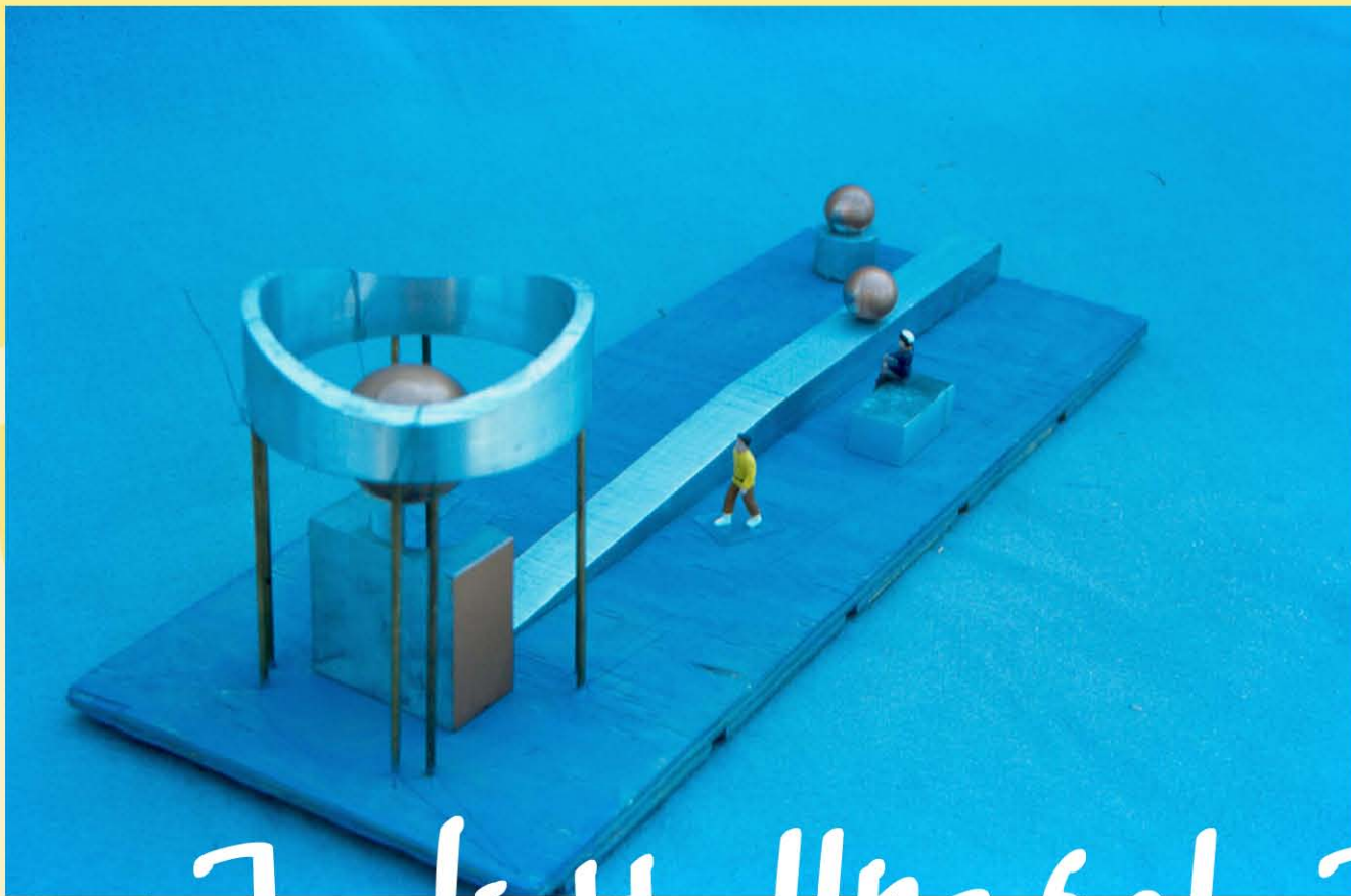
TRINITY, stainless steel, bronze, limestone and water, 14' x 40' x 18"