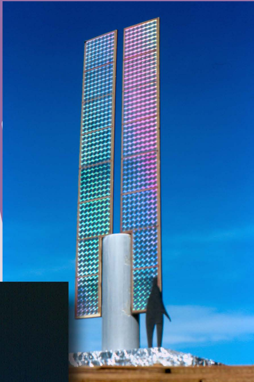
SUNRISE/SUNSET TOTEM, powder coated steel and stainless steel, diffraction foil, glazing modules, 28' high x 6' wide