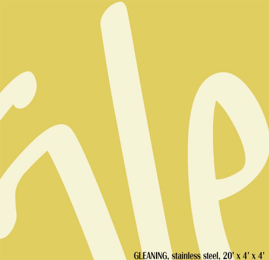
GLEANING, stainless steel, 20' x 4' x 4'